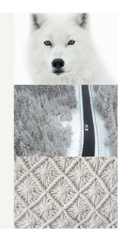
SW 7757 Reflective White