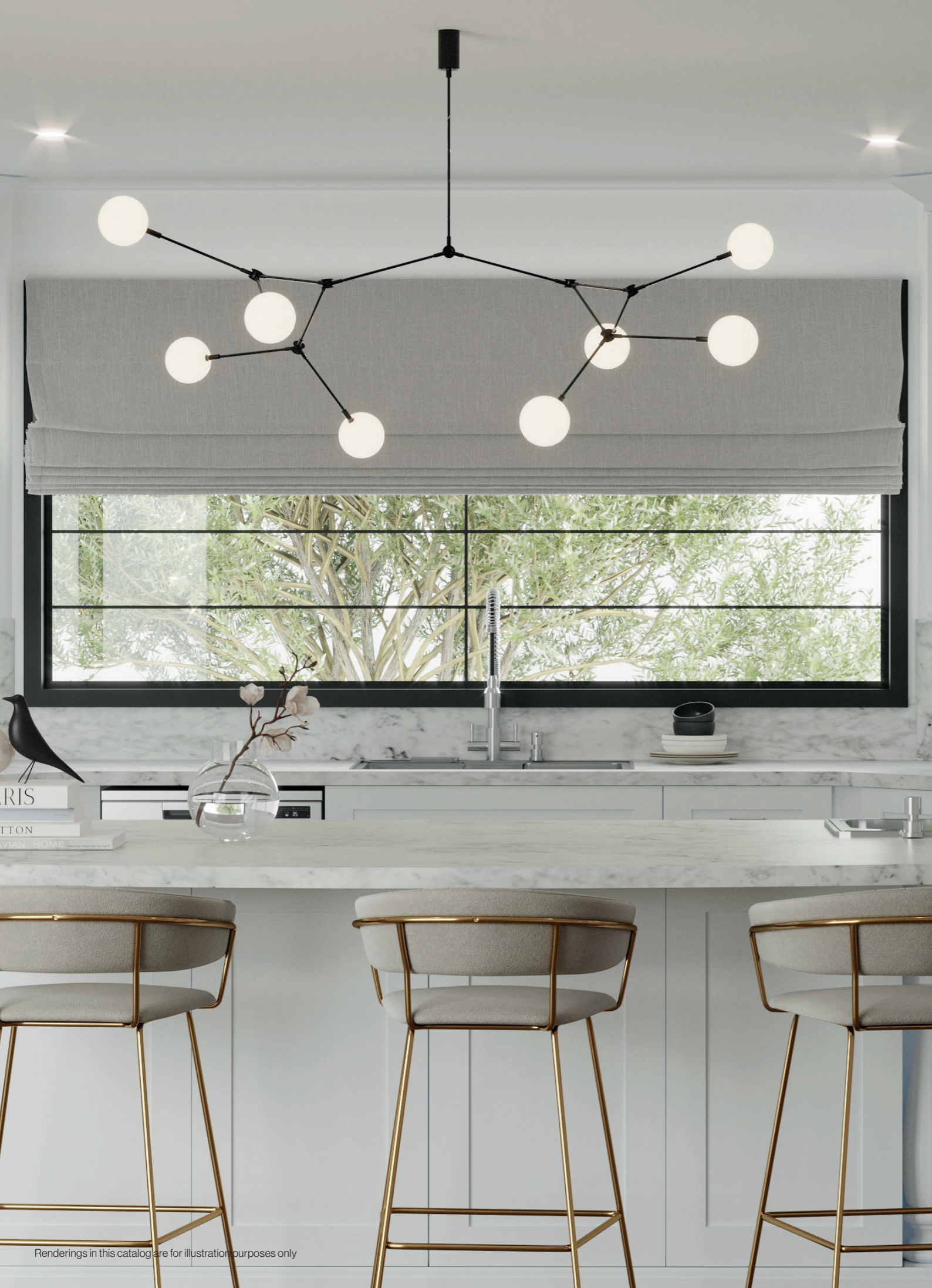
Renderings in this catalog are for illustration purposes only

We are driven to achieve perfection by our passion. At Adornus we believe that our people hold the key to our success, so we constantly pour into training, team-building, and support them like family. We have a passion for our plant, and constantly invest in state of the art equipment, elevated safety standards, and pride ourselves in our minimum waste philosophies. And when our people and our plant come together, our truest passion comes to life. Our product. We believe so deeply in the quality of our product, we offer one of the best warranties in the industry, and we stand behind it.